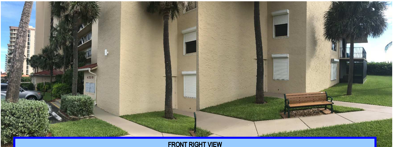
FRONT RIGHT VIEW