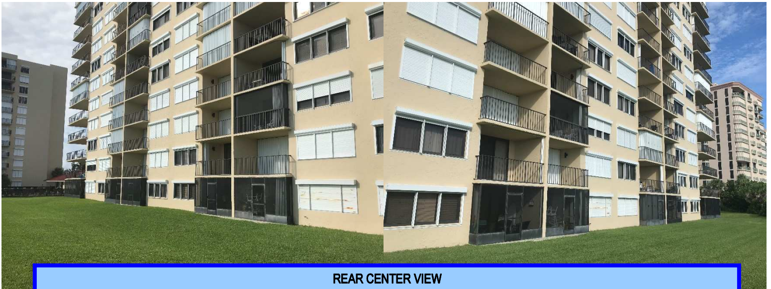
REAR CENTER VIEW