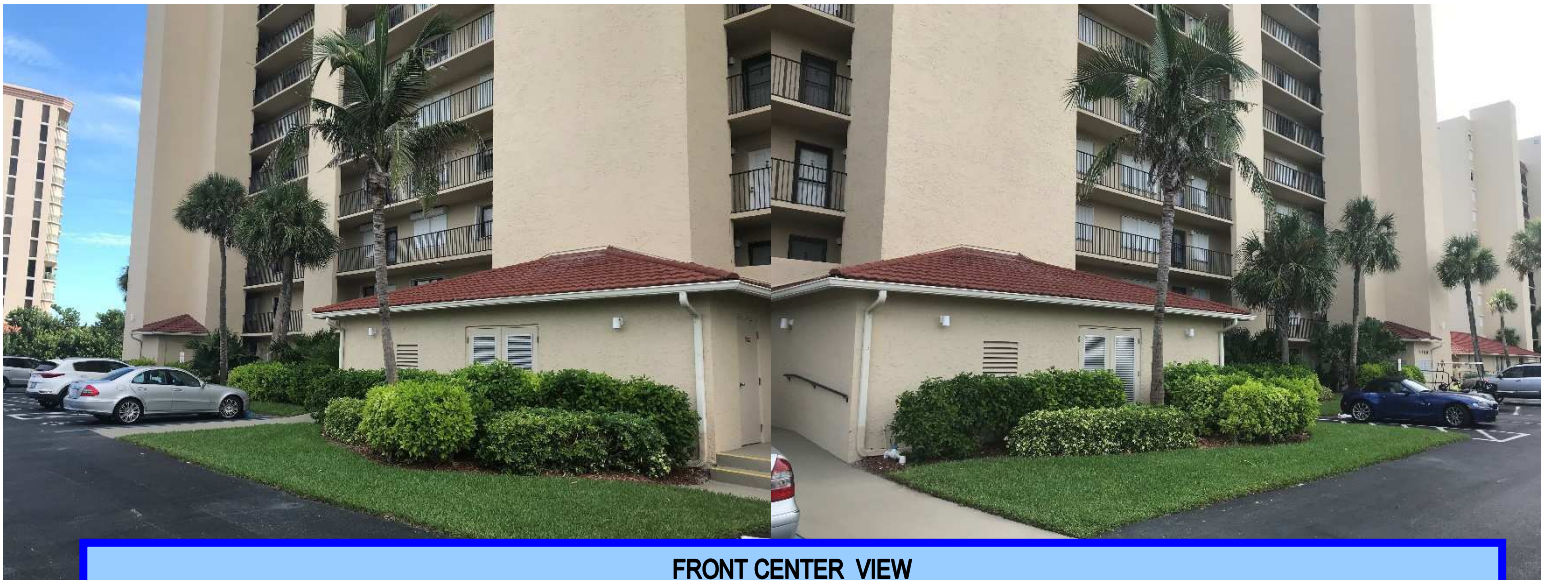
FRONT CENTER VIEW