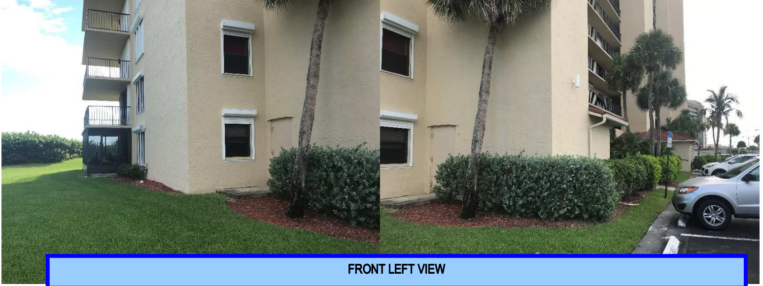
FRONT LEFT VIEW